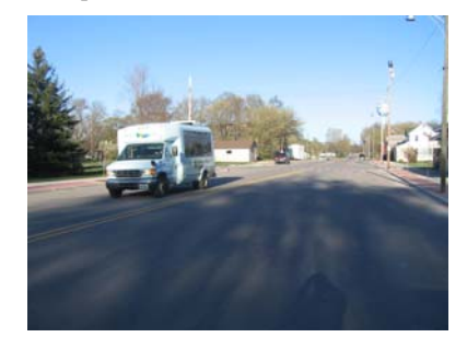
Community Goal - Provide a variety of transportation choices.

Community Objective – Promote and provide for safe and efficient transportation infrastructure that serves pedestrians and bicyclists, especially in the downtown.